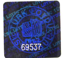
Hasan HABİBOĞLU Surveyor

This certificate is subject to terms and conditions below; Product Certificate is valid for tested equipments. This certificate is not valid for products without TL stamp hereby mentioned. Any change in approval condition and product will revoke this certificate. Product certificate is not used as Type Approval Certificate.